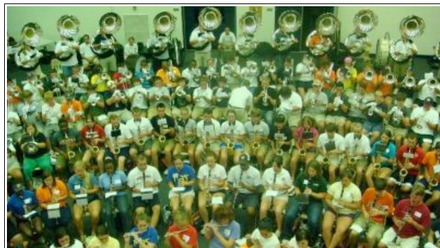
The current, crowded band hall in Goodwin Music Building.

Please visit http://www.auburn.edu/auband/giving for more details!