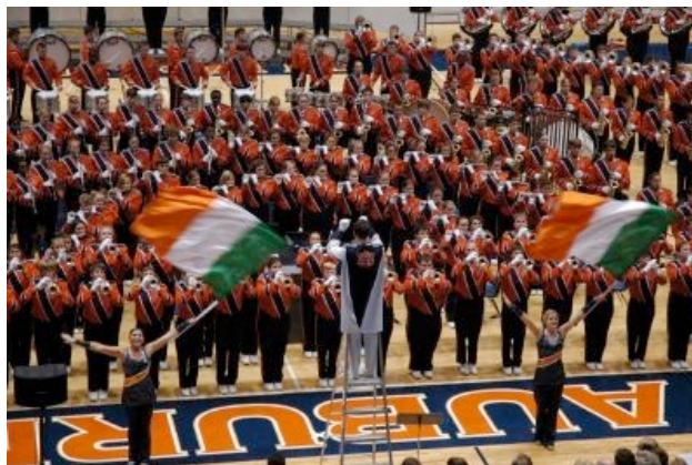
The 2008 AUMB performing their Ireland-themed halftime show program for the Sounds of Auburn concert.