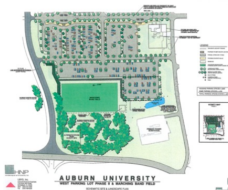
Planned location for the new $15M music building.